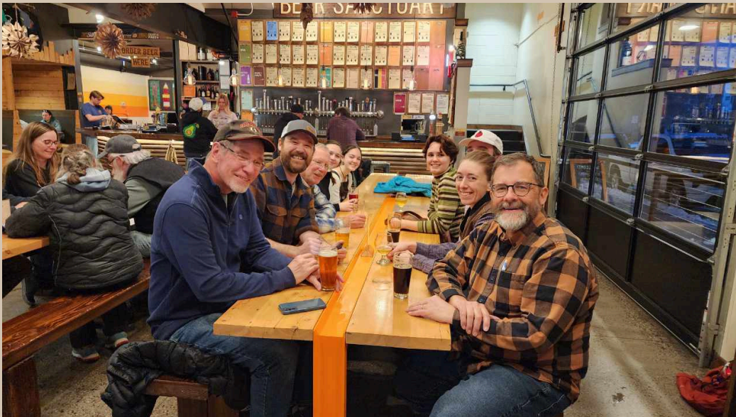
MAS Happy Hour in Bozeman

Layers of Time: Explore, Educate & Engage